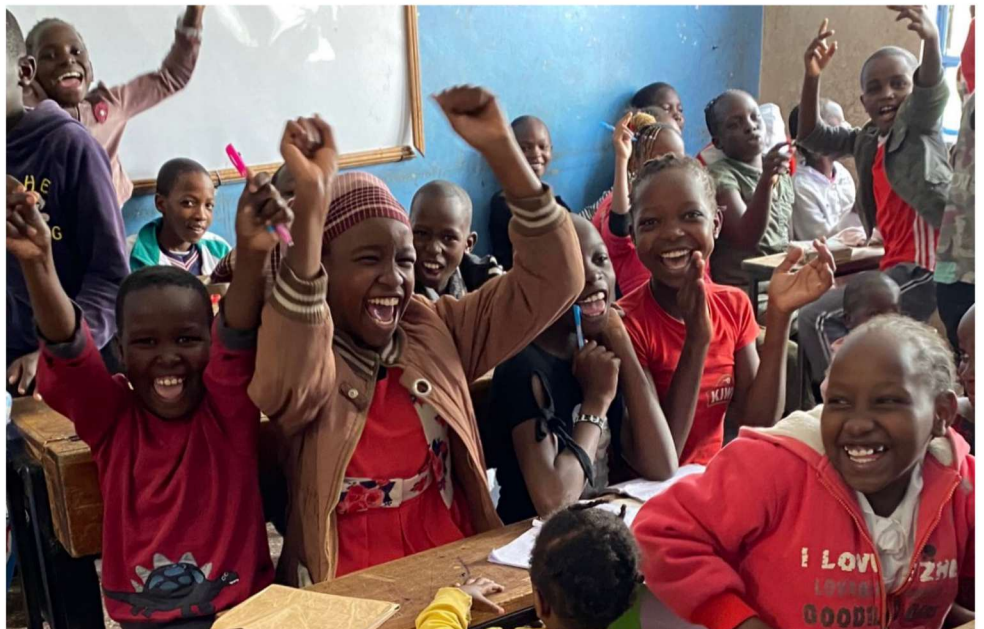
Photo right: All Soweto children love being at Vacation Bible School. This photo was taken in November, 2023, at the end of the school year. The holiday program is partly sponsored by the Maryborough Baptist Church, Qld.