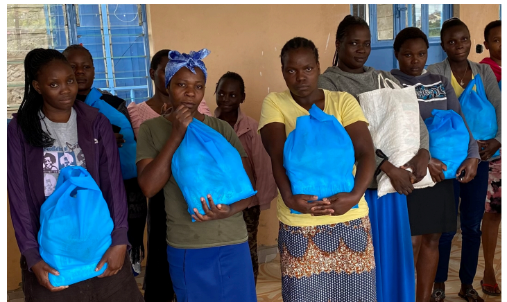
(Photo) families receive food parcels after the floods have destroyed homes